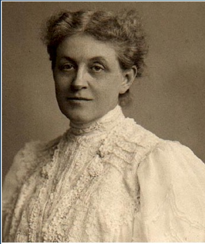
Carrie Chapman Catt, 1859-1947