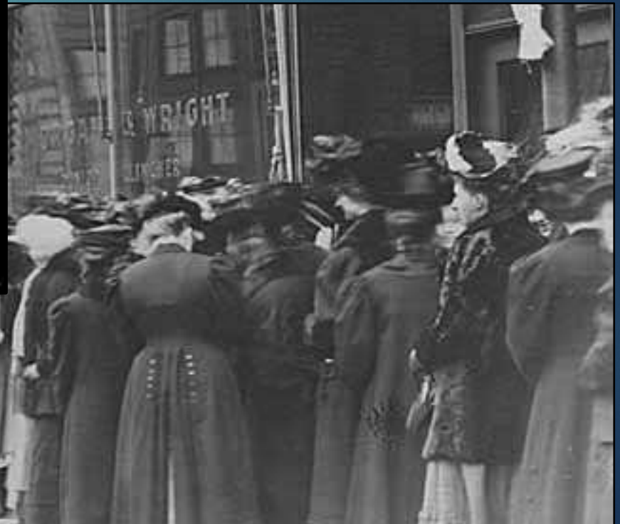
Nov 1920 voting