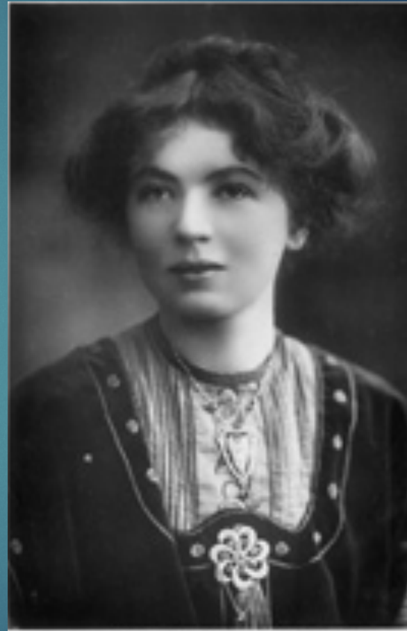
Christabel Pankhurst 1880-1958