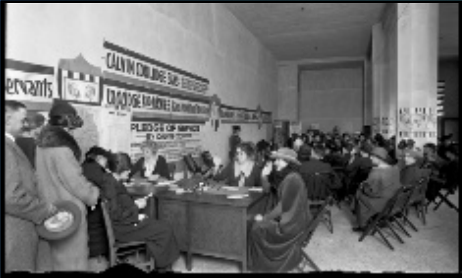
8th & Nicollet registration