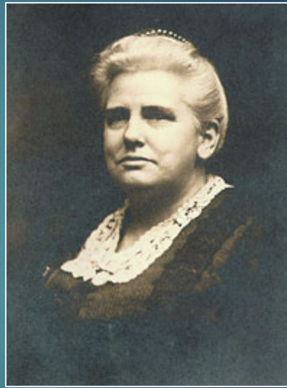
Anna Howard Shaw, 1847-1919

"Nothing bigger can come to a human being than to love a great cause more than life itself."