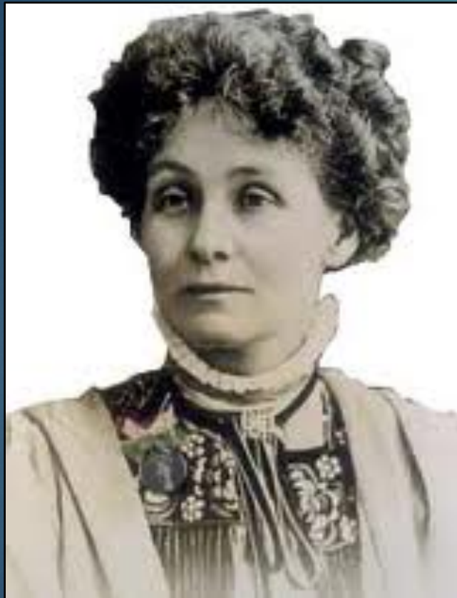
Emmeline Pankhurst, 1858-1928