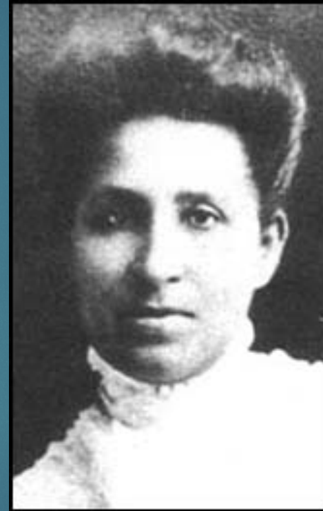
Mary Church Terrell, 1863-1954