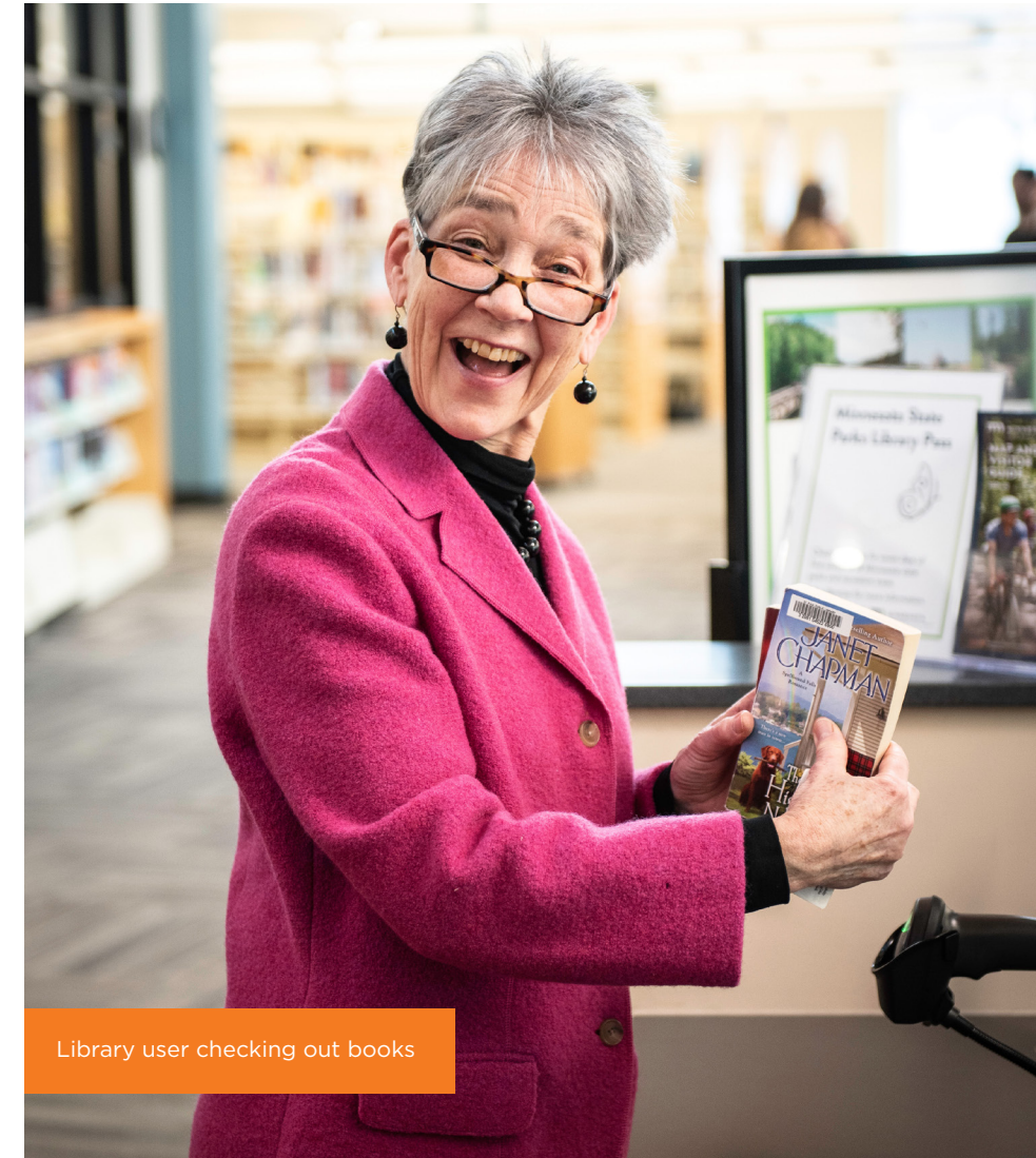
Library user checking out books